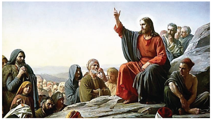
Luke 6:17, 20-26 ♦ Jesus teaches the crowd the way to happiness.

11:30 am – Intentions of the Parishioners of St. Mark